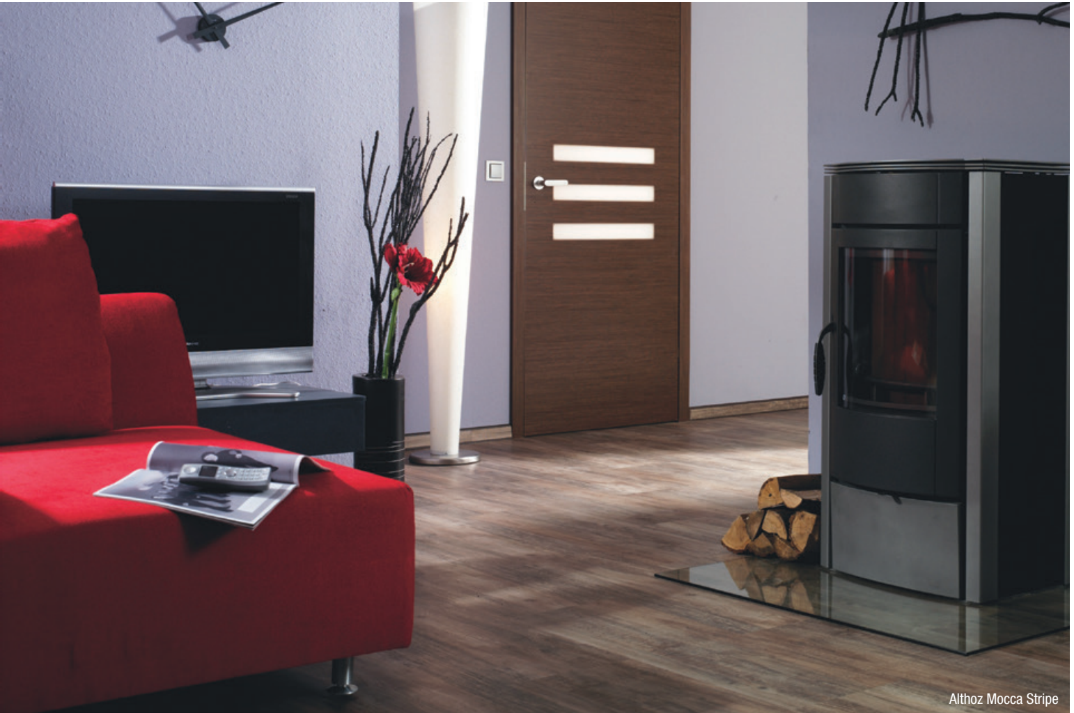
Althoz Mocca Stripe